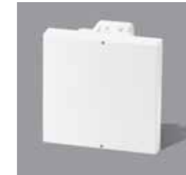
CW224WHI 32A DP Switch - 2M