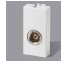
CW451WHI TV Coaxial outlet - 1M

Citric communication range consists of TV coaxial - 1M, Computer jack - 1M and Telephone jack - 1M. The entire range is designed for maximum data and voice transfer efficiency. Features in the range are designed to deliver minimal signal loss, ease of installation and low maintenance.