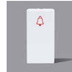
CW505NWHI 6A One-Way Bell push with LED - 1M