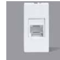
CW493WHI RJ45 CAT6 Computer Jack - 1M