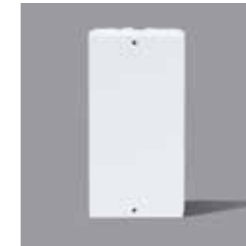
CW502WHI 6AX 2Way Switch - 1M