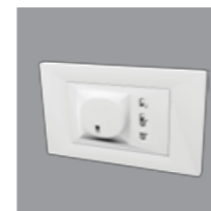
CW529WHI Shaver Socket

Citric hospitality range is smart energy saving specially designed for the hotel industry. It saves energy without compromising the comfort of the guest. Feature packed and with superior aesthetics, Citric range of hospitality products are in complete synergy with the hospitality industry requirements. The range is convenient, safe and efficient.