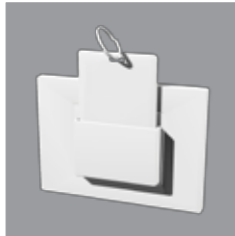
CW527WHI 20A Energy Key Switch with Time Delay