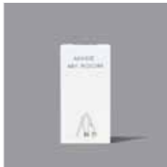
CW415WHI 1 Way Switch MMR - 1M