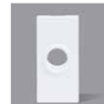
CW462WHI Satellite Cable TV Outlet - 1M

RJ45 CAT6 Computer Jack L - 45mm, B - 22.4 mm, D - 32.3 mm; RJ11 2 Line Telephone Jack with and without shutter L - 45mm, B - 25mm, D - 18.10mm