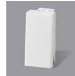
CW501WHI 6AX 1Way Switch - 1M

CITRIC switches impresses with its futuristic play on modern yet simple accents. The new Citric switch has clean-lined, contemporary definition of shape accented with sharp edges and glossy finish. These Collarless switches deliver better elegance. The Arc Shield and Shock proof design with incorporation of double rocker system makes the switches more durable and safe. Designed for front loading and removal with precision engineered snaps. Small elegant LED Indicators are provided for identification at night.