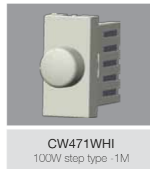
CW471WHI 100W step type -1M