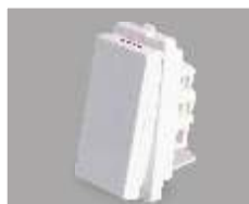
16A One Way Switch