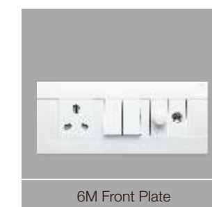
6M Front Plate