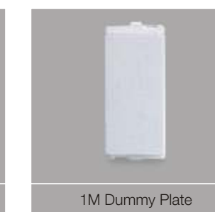
1M Dummy Plate