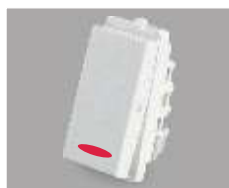
6A One Way with Indicator

Rated Voltage: 250V | Rated Current: 6A | Nature of Supply: 50Hz AC only | Terminal Capacity: 2.5 sq mm