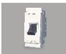
25A Mini Trip Switch