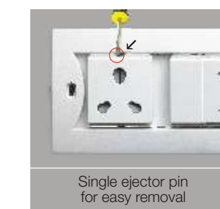
Single ejector pin for easy removal

MIDAS' contemporary screw-less finish and smart design adds beauty to every wall in your home | Superior gloss finish minimises dust accumulation forever | Smart engineered front plates facilitate front loading and removal of accessories; module can be easily installed or rearranged without removing the grid plate from the wall | Multi pin snap-on plates ensure rigid engagement of the front plate forever | MK MIDAS range ensures perfect alignment and smart workmanship when installed on the wall and enhances the aesthetics | Single ejector point on the grid for easy removal of accessories | 2M size separators in the grid plate ensure that there will not be any pop-outs of the accessories forever after assembly | MK MIDAS range of front plates are suitable for commonly available metal boxes | Front plates are available in 1M, 2M, 3M, 4M, 6M, 8M(V), 8M(H), 12M & 18M