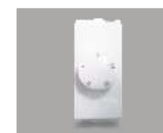
100W 4 Step Fan Controller