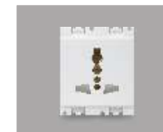
6A upto 13A Socket