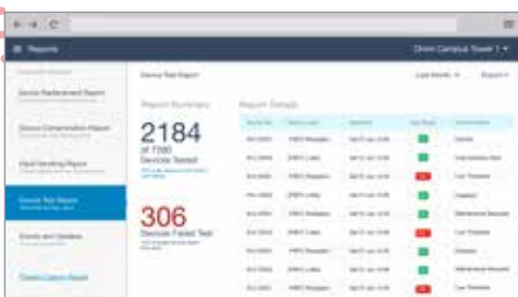
Intelligent reporting at your fingertips